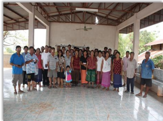
Most of the group with new glasses