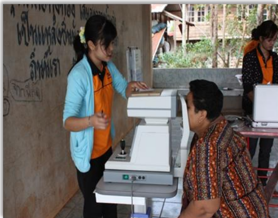
Getting eyes examined

Through your gifts sent we were able to help 62 more people have their eyes examined and get new glasses. It was exciting to see different ones put on their new glasses and be able to see clearly, some for the first time. It is neat to think also that maybe one day some of these same people will be using these glasses to read the Bible. One of the headmen told us that this glasses project was so needful and he saw that it really helped people out so much. There are still many folks here that cannot see well. We would look forward to doing this again, not only for the older folks, but many of the children have never had their eyes checked. Maybe you could have a part.