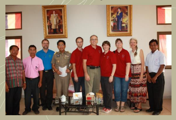
Visiting with the Mayor