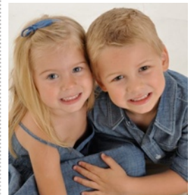
They are best friends.

“Ang lahat ng ito’y magagawa ko dahil sa lakas na kalooob sa akin ni Cristo.” Filipos 4:13