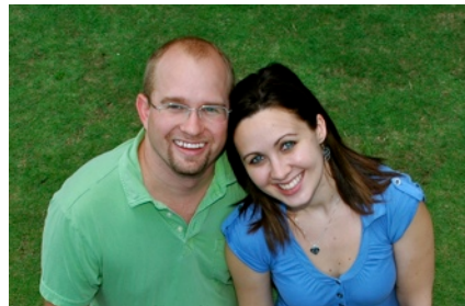
We've been married for 7 years!