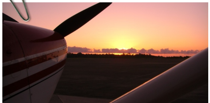
Runway in Palawan at sunrise