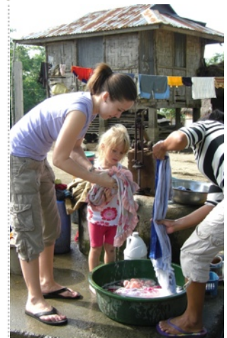
Washing clothes in a village on Northern Luzon