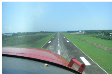
Final approach at Puerto Princesa