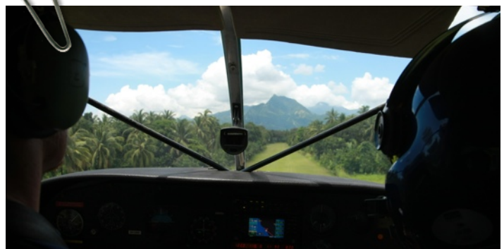
Riding in the right seat on Palawan to learn the routes and approaches

Language school is done and we are settled into our new home on Palawan. We are excited to be serving with a team of about 15 other families to reach the 12 different language groups represented on Palawan. A number of these language groups have mature churches already established, but there are at least six tribal groups that either still need to hear the gospel, or need further discipleship and translation work. Our focus is on these six groups who still have little or no access to the gospel in their own language, and we are currently working with all of them. As a pilot, our role is to provide safe, efficient transportation into remote tribal areas for our fellow missionaries, their groceries and other supplies, as well as medical evacuations, and anything else we can do to aid them as they share the gospel, disciple new believers, and translate scripture. Please continue to pray for us as we handle the responsibility of the flight program on Palawan while our NTMA coworkers return home for a year for a much needed furlough.