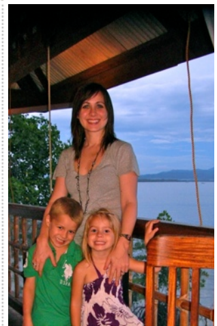
At our favorite restaurant