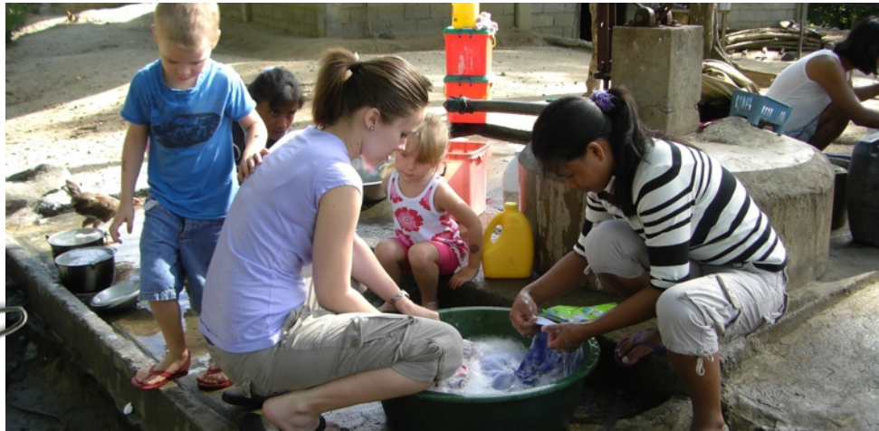
Doing laundry in a tribe on Northern Luzon