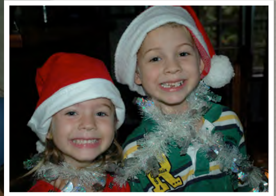
MY BEAUTIFUL CO-PILOT (LEFT) CHRISTMAS IN THE TROPICS (ABOVE)