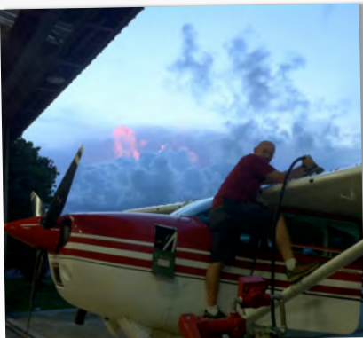
FUELING FOR AN EARLY FLIGHT