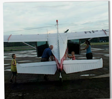
PUSHING THE PLANE OUT