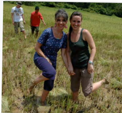
HARVESTING RICE IN A TRIBE