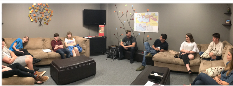
Challenging the Youth to Play Their Part in Missions