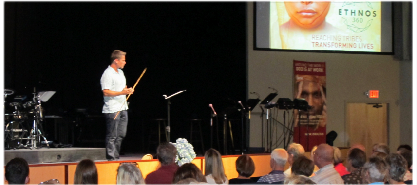
Inviting Others to Partner in The Great Commission