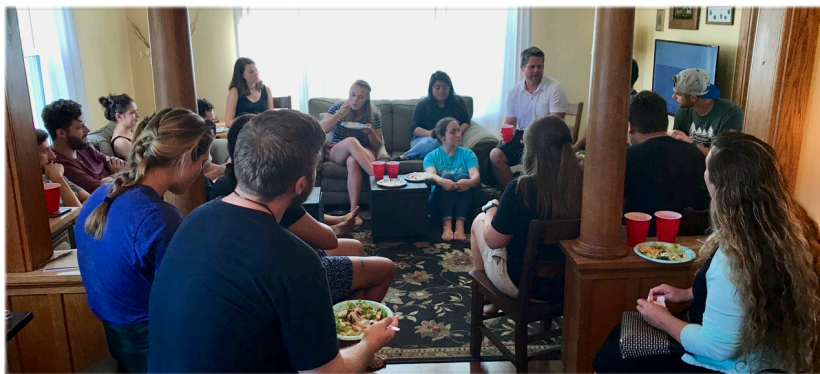
Sharing About Alumni Coaching at Ethnos360 Bible Institute