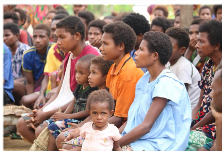
The Kaje People - Papua New Guinea