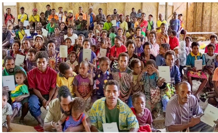
The Menya Church

The Menya, Pei, Wantakia, Amdu, and Kaje are people groups in Papua New Guinea who recently heard the Gospel for the very first time!