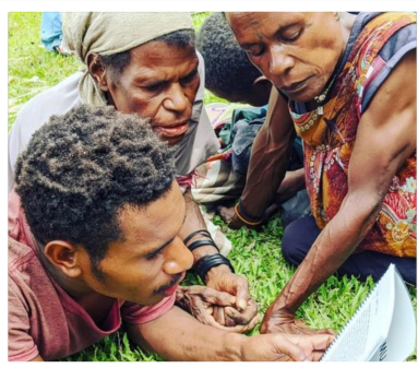
Reading Romans for the First Time!

As translation continues, they are being taught and receiving copies of new books in the New Testament. They are being grounded and equipped as God moves them toward spiritual maturity. They will be the ones to take on the responsibility of leading and multiplying themselves.