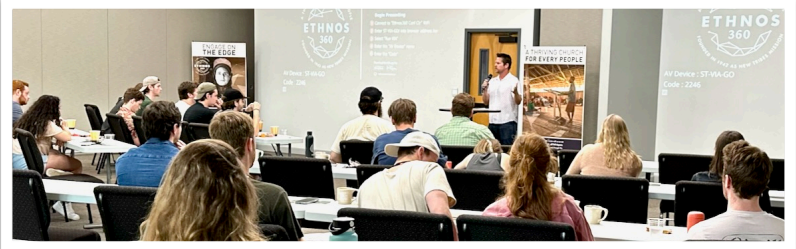
Presenting Alumni Coaching to a Group of EBI Students