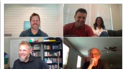
My Team of Alumni Coaches