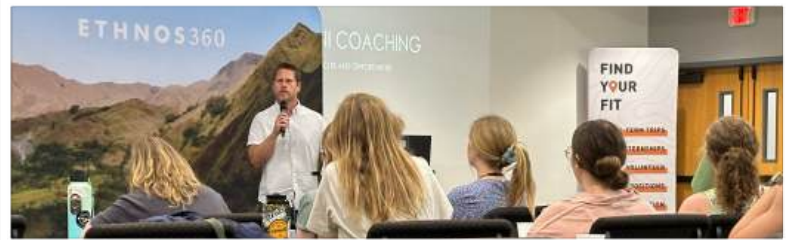
Presenting Alumni Coaching to a Group of EBI Students