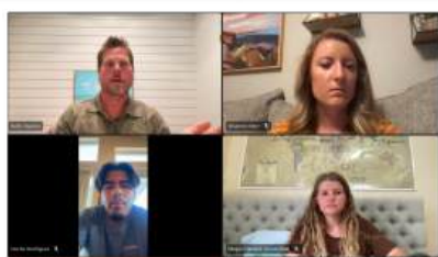
Meeting with Students Online

Jacqueline and I spend most of our time helping EBI students and Alumni develop in all three of these areas with a focus on spiritual development. We are always keeping in mind what we are preparing them for.