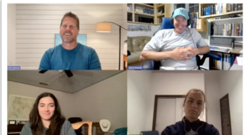
EBI Online Small Group Discussion We now have 110 Students Online!