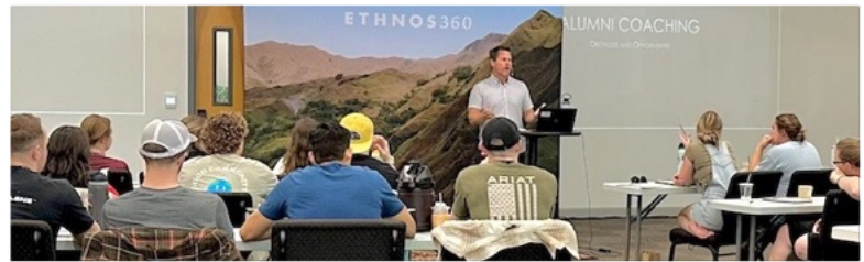
Presenting Alumni Coaching to a Group of EBI Students